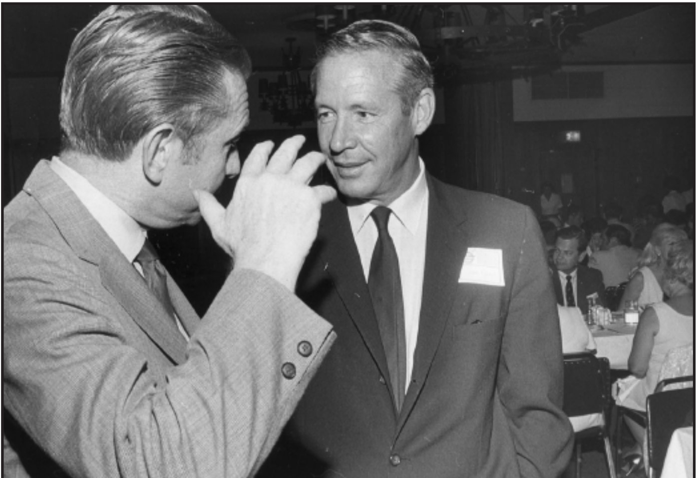
© The Arizona Republic, May 29, 1969. Photo by Yul Conaway. Used with permission. Permission does not imply endorsement.

As a very young lawyer, I met with many of the most prominent lawyers in town, either because they had been hired by the opposition in a civil case, or because they or, more often, a family member had a sensitive problem that required John Flynn's special assistance. Among other things, I learned that extremely conservative people often become unrealistically expansive civil libertarians when someone close to them faces a possible criminal charge.