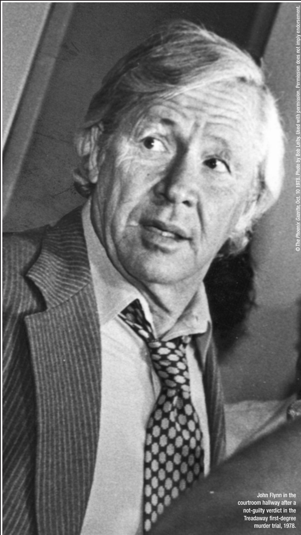
© The Phoenix Gazette, Oct. 10 1978. Photo by Bob Leiby. Used with permission. Permission does not imply endorsement.