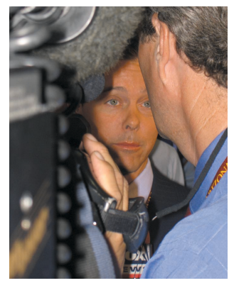
Post-debate media-swarm: Turn to p. 41 to identify the media prey.

We also have some photos of political visi-