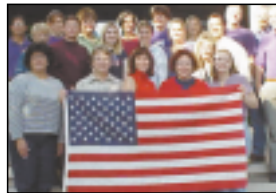
Jennings, Haug and Cunningham staff