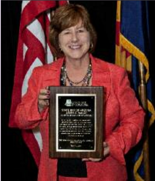
Hon. Rebecca White Berch