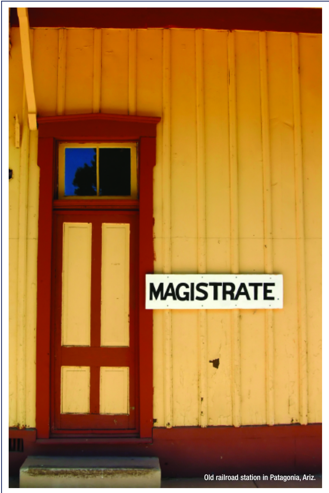
Old railroad station in Patagonia, Ariz.