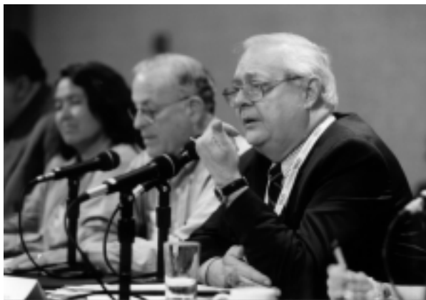
Blue-Ribbon panel opens the floor for debate about lawyers' relevance to the public.