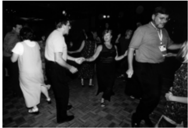
Bar members dance the night away to the tunes of Duck Soup.