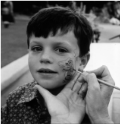
Many children's activities were also offered at this year's convention, including face painting and balloon artists.